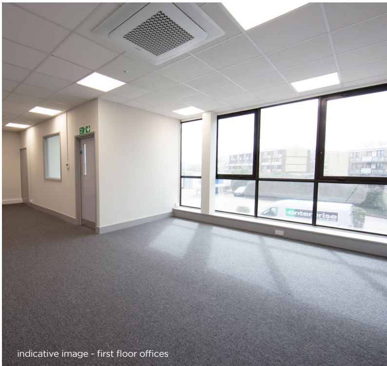
indicative image - first floor offices